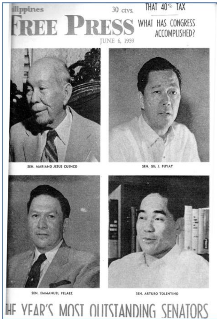
Sen. Mariano Jesus Cuenco on magazine cover (June 6, 1959)