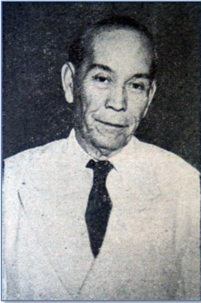
Senator Mariano Jesus Cuenco served as President of the Malayan Insurance Co. (1949-1950) during the company's recovery from World War II.