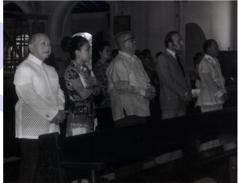
Malayan Insurance Chairman Carlos P. Romulo joins the celebration of the Holy Mass for the 10 th anniversary of Pan Malayan Insurance Corp. (PMIC) in March 1974.