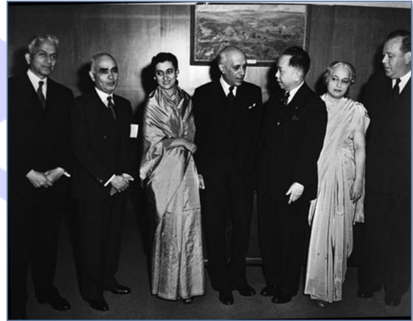
Prime Minister Jawaharlal Nehru of India (MIDDLE) talks to UN General Assembly President Carlos P. Romulo. Accompanying Prime Minister Nehru is his daughter Indira Gandhi (THIRD FROM LEFT), who would also be the country's Prime Minister. (1950)