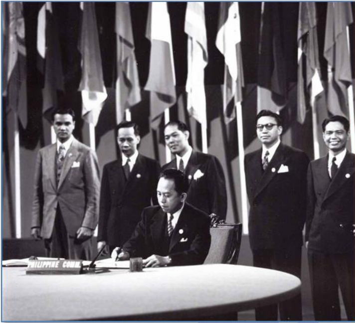
Carlos P. Romulo signs the UN Charter for the Philippine government during the founding of the United Nations in 1946.