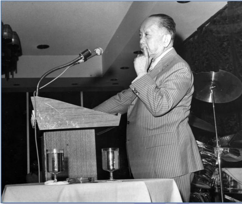
Malayan Insurance Chairman Carlos P. Romulo welcomes guests to the inauguration of the Malayan House in Guam. (1975)