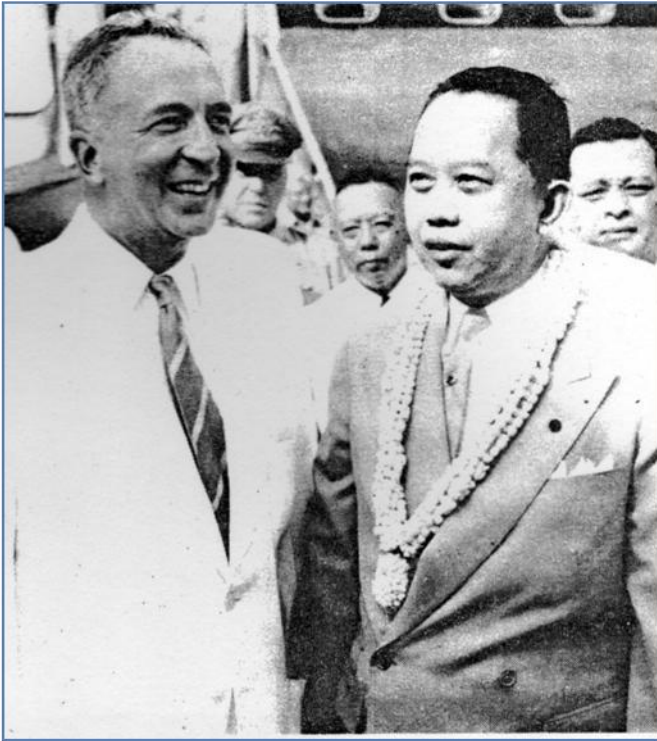
Secretary of Foreign Affairs Carlos P. Romulo exchanges pleasantries with U.S. Ambassador Myron M. Cowen. (1951)